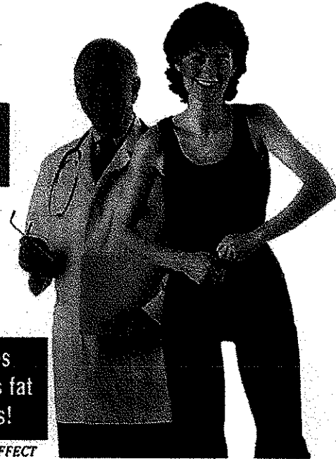
Melt away fat 3 times faster than jogging 4 miles a day, 12 times faster than a full hour of military aerobics!

Lose up to 15 pounds a week with the amazing formula that forces your body to release fat!