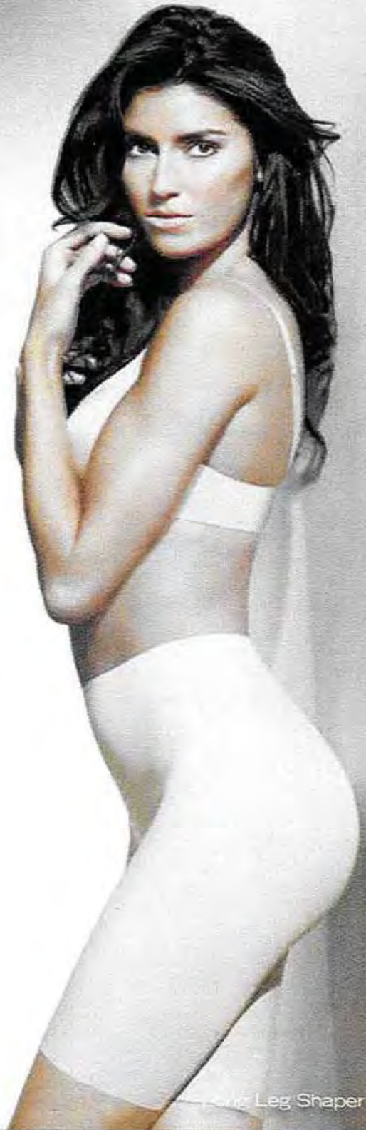
Hi-Waist Long Leg Shaper

Wacoal's new iPant offers superior comfort and smoothing along with amazing cosmetic benefits. The iPant is constructed of Novare! Slim® nylon microfibers with embedded microcapsules containing caffeine to promote fat destruction; vitamin E to prevent the effects of aging; ceramides to restore and maintain the skin's smoothness; and retinol and aloe vera to moisturize and increase the firmness of the skin. The iPant with LYCRA® beauty fabric shapes and sculpts as it releases ingredients into your skin while you move throughout the day.