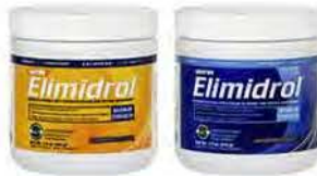
Elimidrol - Opiate Withdrawal Relief Supplement

James Rosland Sunrise Nutraceuticals +1 800-801-7924 Email