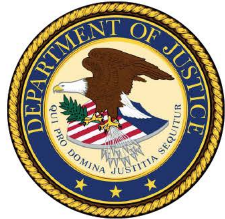
Department of Justice Antitrust Division