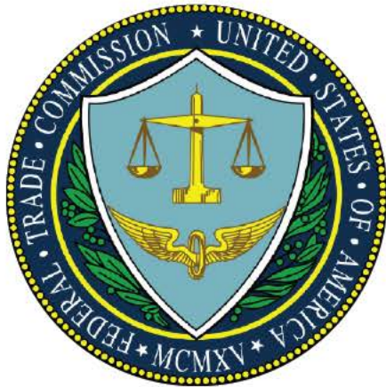
Federal Trade Commission Bureau of Competition