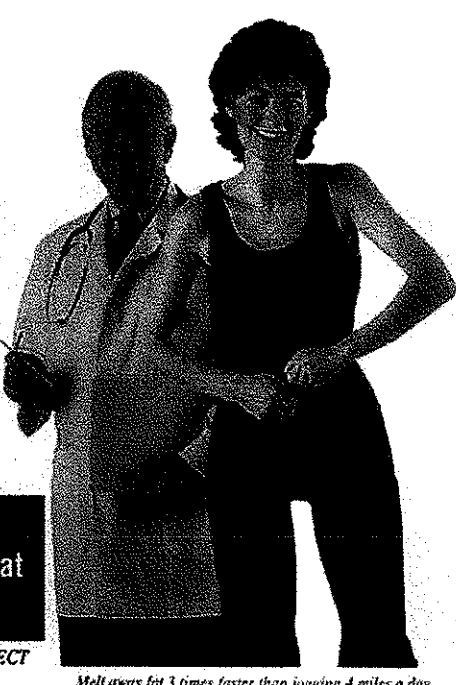
Melt away fat 3 times faster than jogging 4 miles a day, 12 times faster than a full hour of military aerobjes!

When we say NOT EVEN TOTAL STARVATION CAN SLIM YOU DOWN AND FIRM YOU UP THIS FAST - THIS SAFE - We Mean Every Word of It! With Zyladex Plus you'll loose all your unwanted weight and keep it off or you risk nothing. That's right! If you are dissatisfied for any reason whatsoever, simply return the merchandise within thiny days for a No Questions Asked, Unconditional Refund of your product price.