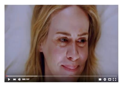
Don't Lose Sight of Your Vision (Video)

Don't Lose Sight of Your Vision (Short Video)