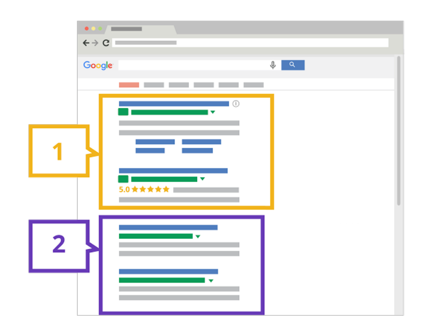
Figure 1: Google AdWords Placement

86. Sponsored links can appear in several different areas of a search results page. These paid advertisements typically appear "along the edge of the page ( e.g. , the top, side, or bottom of the search results page)."<sup>195</sup> The "top" of the page refers to the area above organic search results. For example, Figure 1 below shows the relative location of Google's "ads"<sup>196</sup> to its organic search results.<sup>197</sup> Area 1 represents sponsored links that appear in response to a search inquiry through Google's AdWords program. Area 2 represents the organic search results that appear in response to that same inquiry. Sponsored Links at the "top" of the page are valuable to marketers because "a pre-dominant amount of clicks occur [at the top] for branded queries."<sup>198</sup>