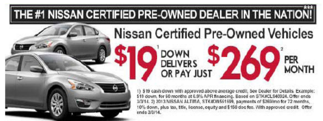
The prominent offer of "$19 DOWN DELIVERS OR PAY JUST $269 PER MONTH" was followed by small, fine print that stated:

15. Respondent's advertisement attached as Exhibit E also promoted the availability of closed-end credit for motor vehicle transactions.