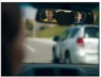
VOICE OVER: Wagner OE' brakes

Text: Fictionalization, simulated accident, involves stunt drivers