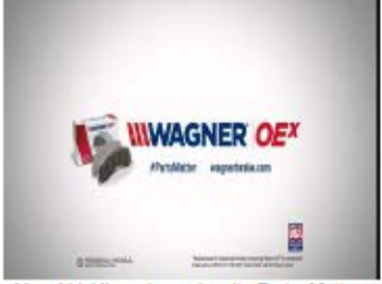
Your kids' lives depend on it. Parts Matter. (Fade Out)

Text: *Results based on independent testing comparing Wagner OE* to competitors' brake pads on 2014 Ford F-150, 2011 RAV4 and 2013 Chevy Tahoe