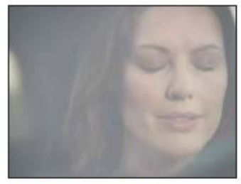
can stop you up to 50 feet sooner.