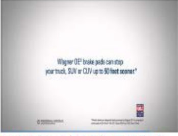
Do you know which brake pads are on your vehicle?