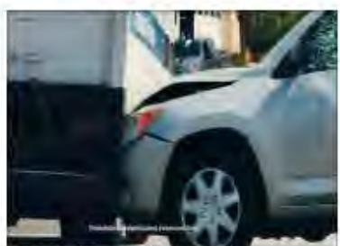
(Vehicle #2 crashes into truck)