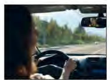
(Fade In) (Woman driving vehicle #1)