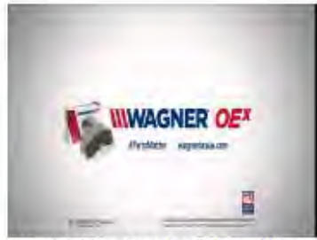
Your kids' lives depend on it. Parts Matter. (Fade Out)

Text: *Results based on independent testing comparing Wagner OE* to competitors' brake pads on 2014 Ford F-150, 2011 RAV4 and 2013 Chevy Tahoe