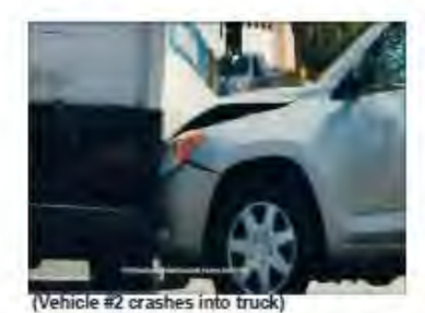
WOMAN in Vehicle #1 - Is even-horly