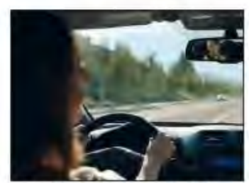
(Fade In) (Woman driving vehicle #1)