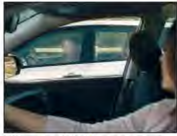
(Woman in vehicle #1 gazes at woman in vehicle #2)