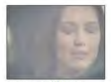
can stop you up to 50 feet sooner.