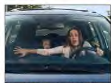
(Driver and passengers of vehicle #1 look fearful)