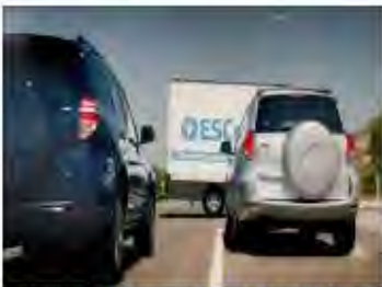
(Vehicle #1 stops safely while vehicle #2 continues moving forward)