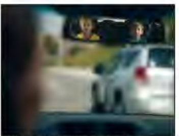
VOICE OVER: Wagner OE' brakes

Text: Fictionalization, simulated accident, involves stunt drivers