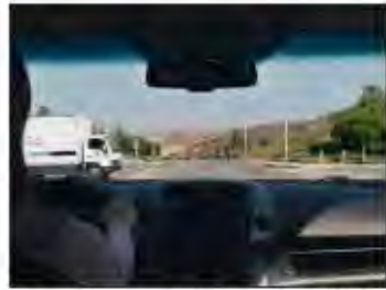
(A truck is crossing in front of vehicles)