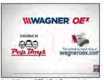
Install Wagner OE<sup>x</sup> at Pep Boys and other leading repair shops. (Fade Out)