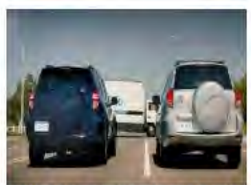
(Brake lights activated on both vehicles)