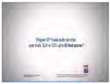
Do you know which brake pads are on your vehicle?