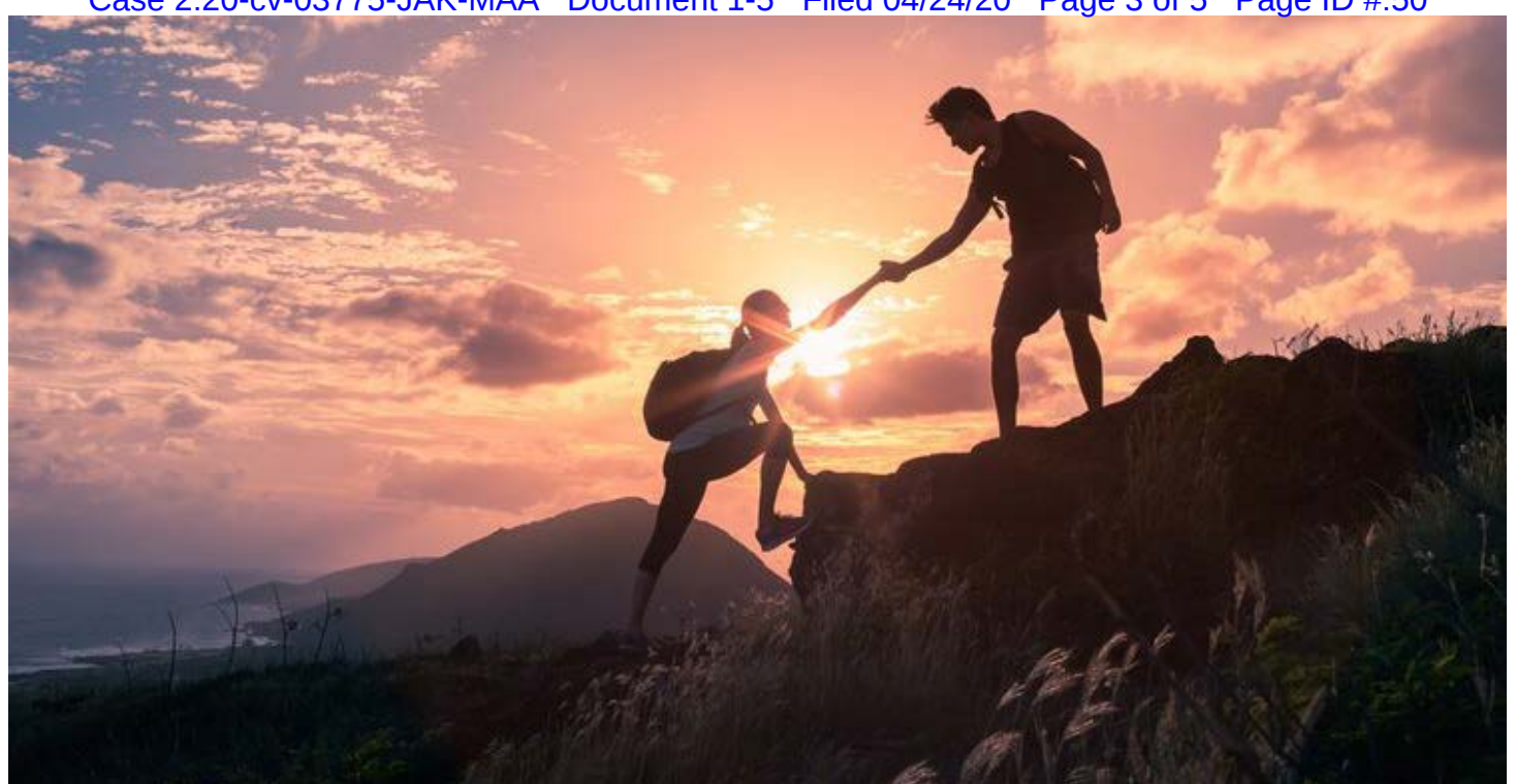
Because we only get one life..

Take control of your life, and let Whole Leaf Organics be the difference you need to reclaim health.