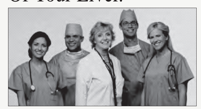
San Diego Medical Conference saw the participation of 200 specialists from 14 countries.

During a notable San Diego Hepatology Conference, over 200 specialists from 14 countries debated the scope of the results of a recent study on the Liver.