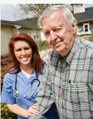
4 weeks after

down the stairs hurt my ankles so badly. I was older but now I just felt elderly.