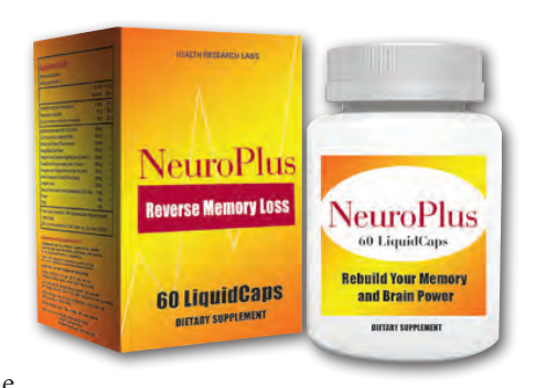
EXHIBIT B, page 8

A: It is 100% safe to use! Researchers, Doctors and Hospitals worldwide have studied the