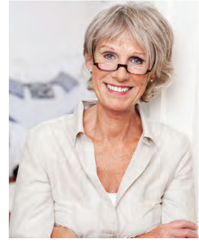
EXHIBIT B, page 5

Do you ever get anxiety and feelings of helplessness? If yes, then you're not alone. With skyrocketing prices... stagnant investments... perpetual unemployment and a job market that discrimi-