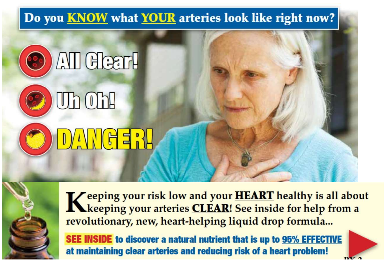
Exhibit C (The Ultimate Heart Formula mailer).