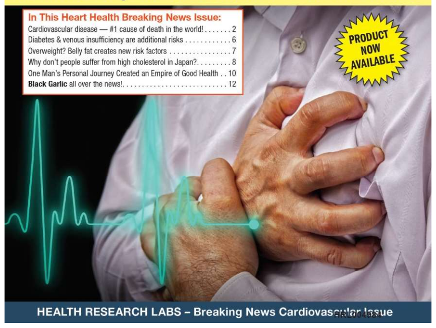
Exhibit A (Black Garlic Botanicals mailer)

This front-page content is followed by additional descriptions of the dangers of cardiovascular disease. For example, the second and third pages display a banner across the top, which states, "Cardiovascular Disease: #1 cause of Death in the world, especially the U.S.!" A banner at the bottom states, "There's a miraculous natural solution that can help – find out what it is!!"